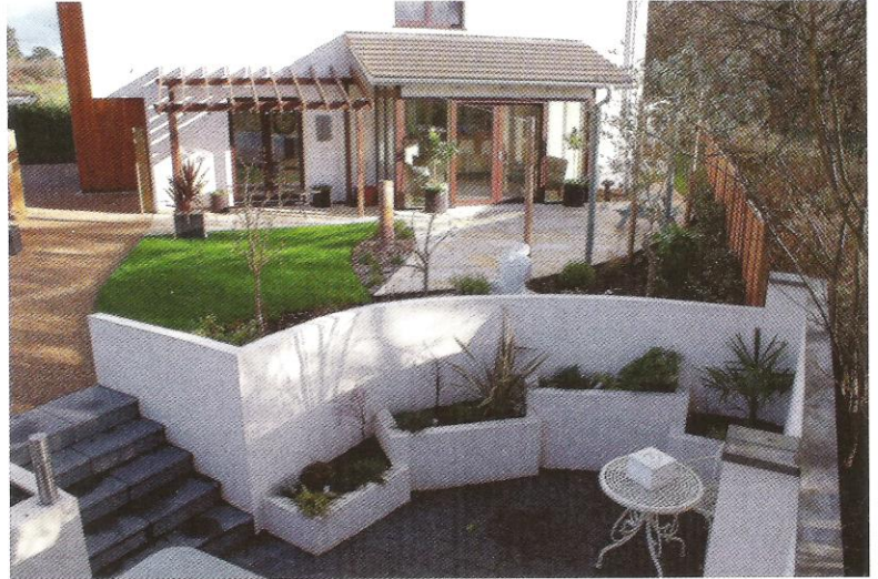
Right: Sandra at work on the roof. Left: K-rend does not require painting. Above: Terraces are accessed via glazed doors off the dining room and kitchen Below: The timber-framed bedroom takes shape.